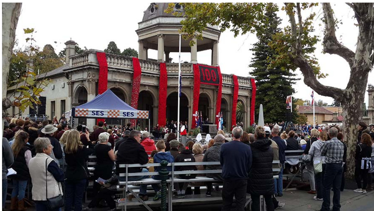
The 2015 Anzac Day Service where thousands of poppies adorn the Memorial Hall.