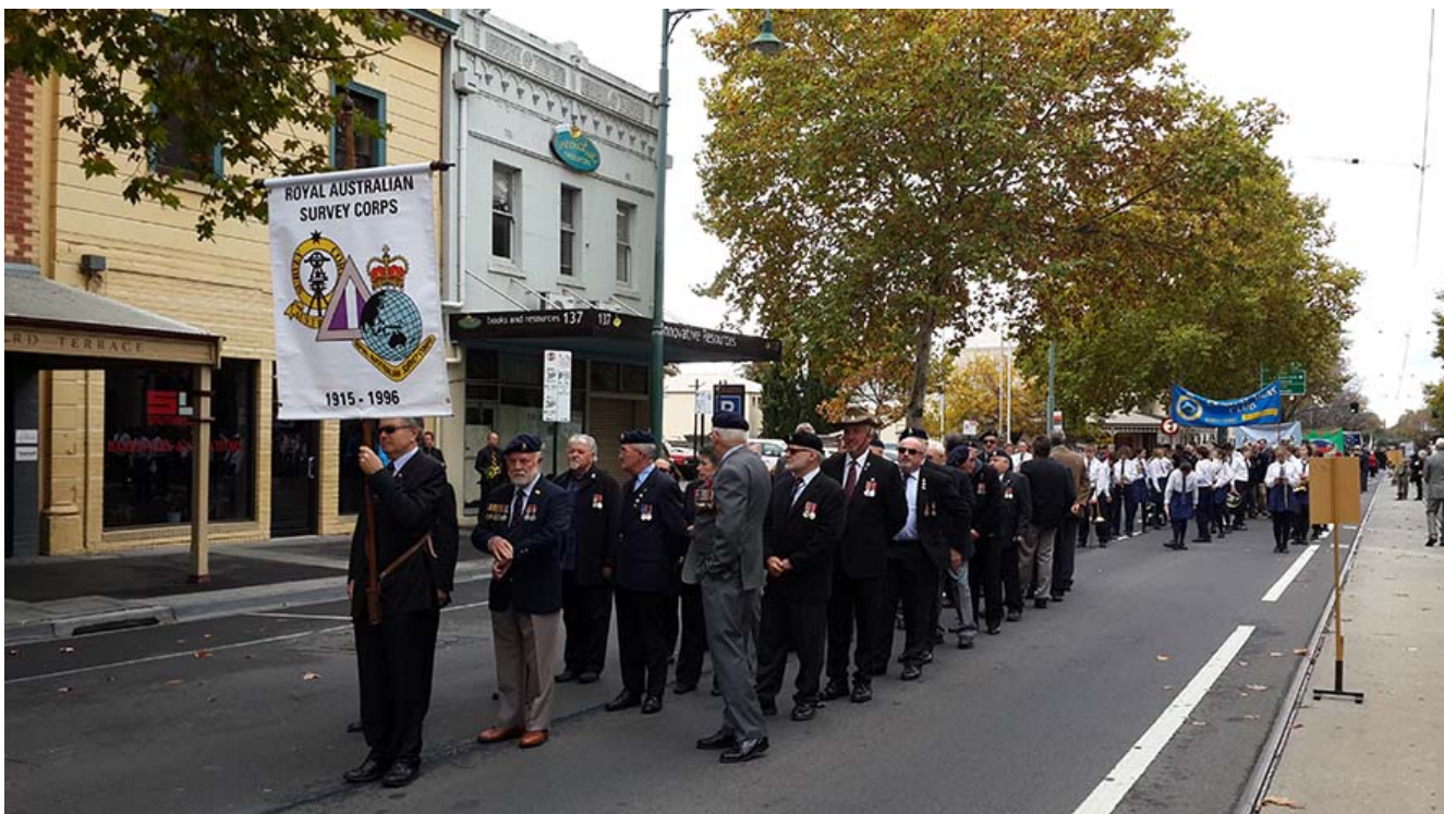
Forming up for the start of the 2015 Anzac Day March.