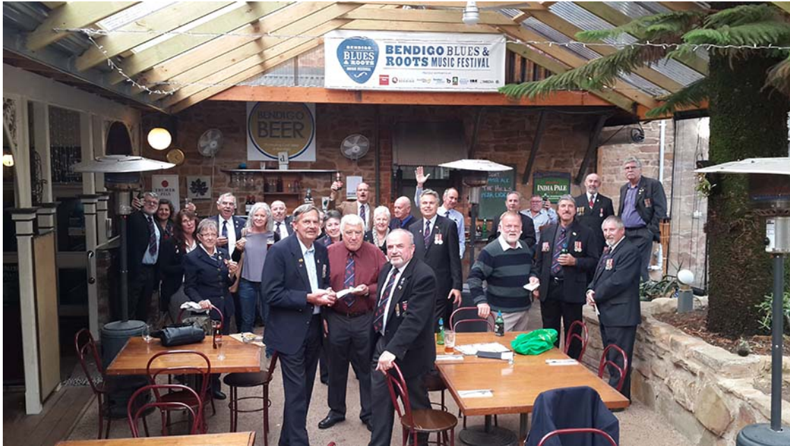
After the 2015 march at the Goldmines