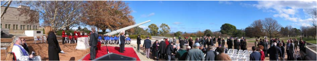
The group assembling prior to the unveiling of the plaque shown below