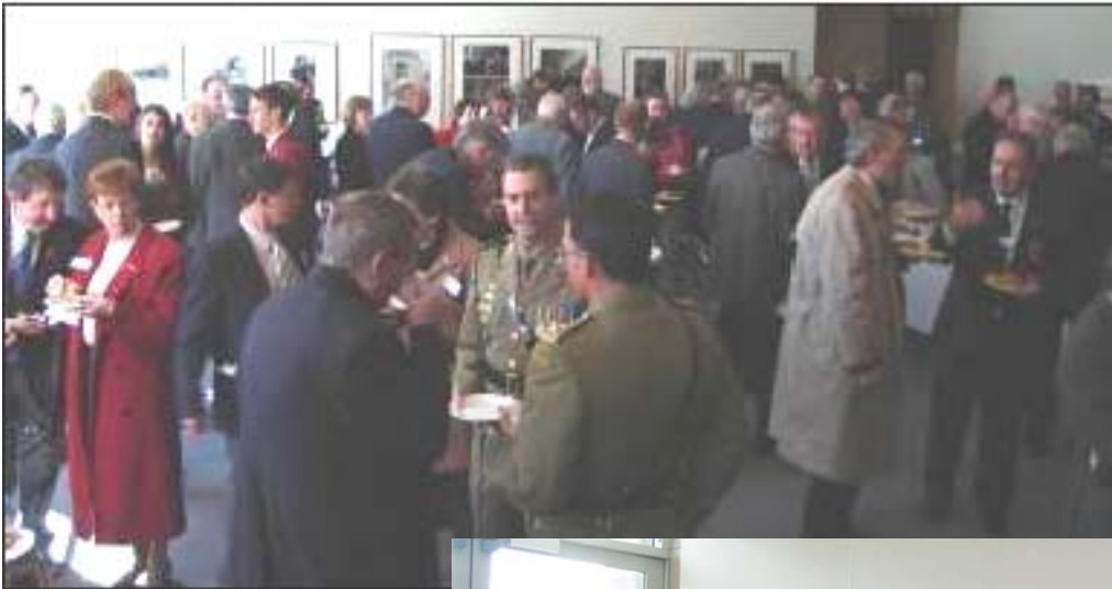
After the ceremony the gathering inside the Australian War Memorial