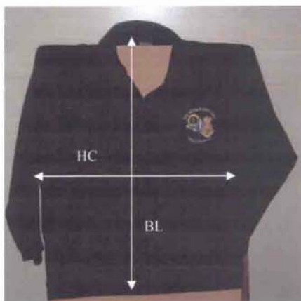
POLO Neck or FLEECY