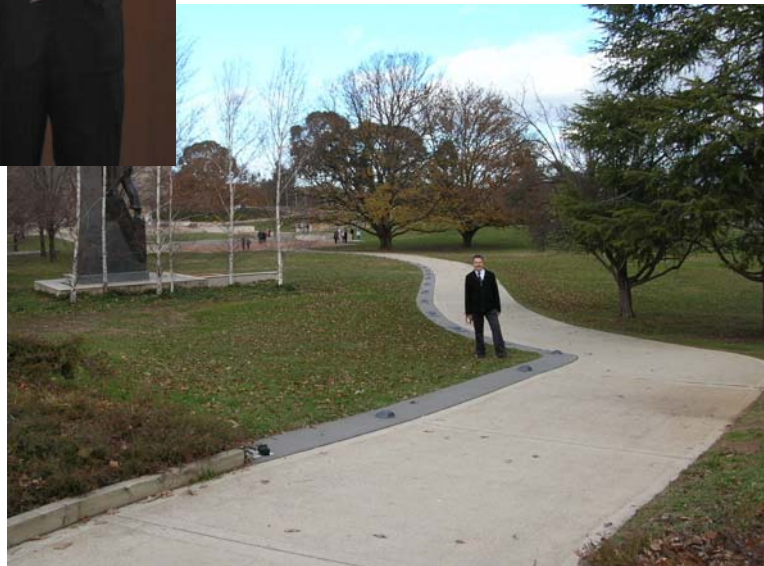
Stuart Symonds marks the site near where the plaque is to be mounted